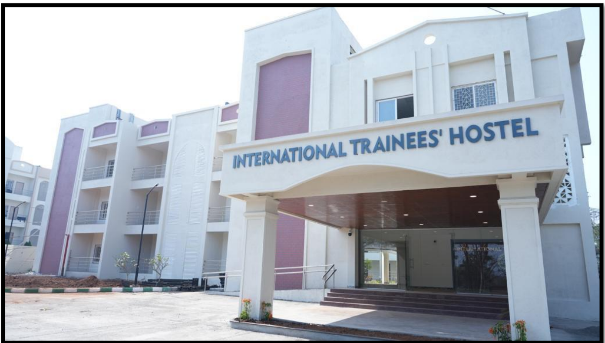
International Trainee's Hostel