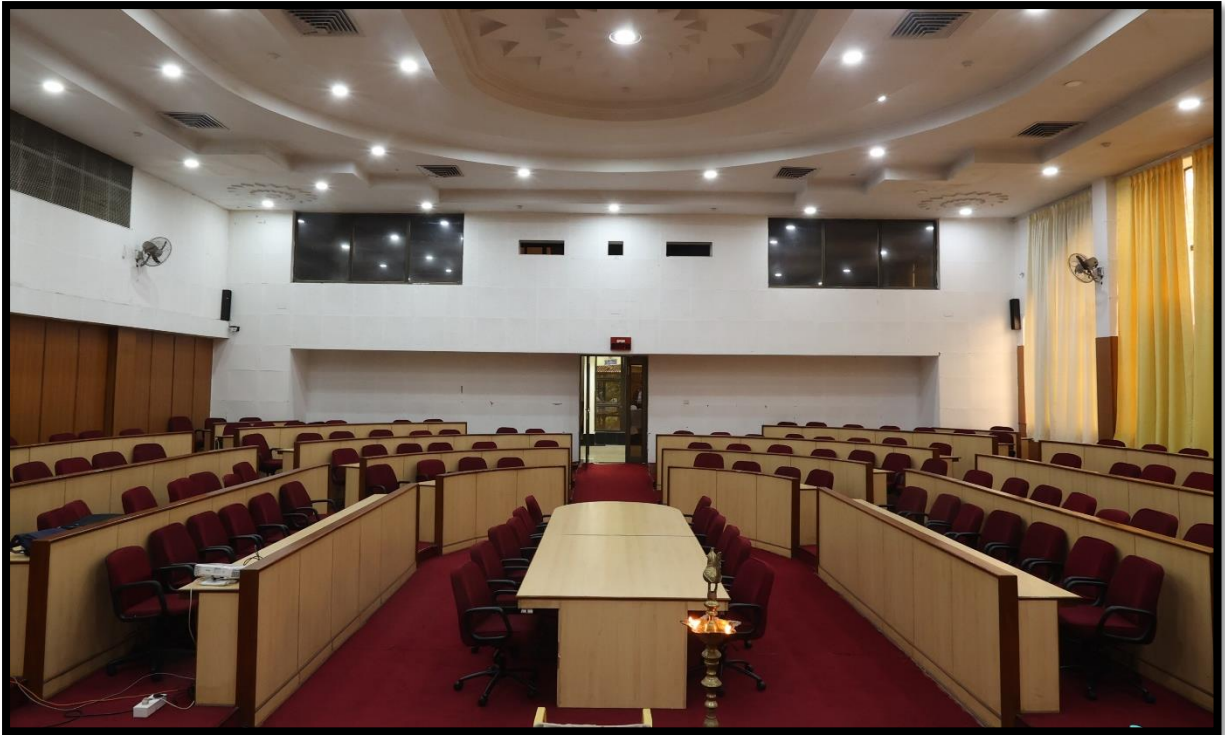
Jubilee Hall- Inside