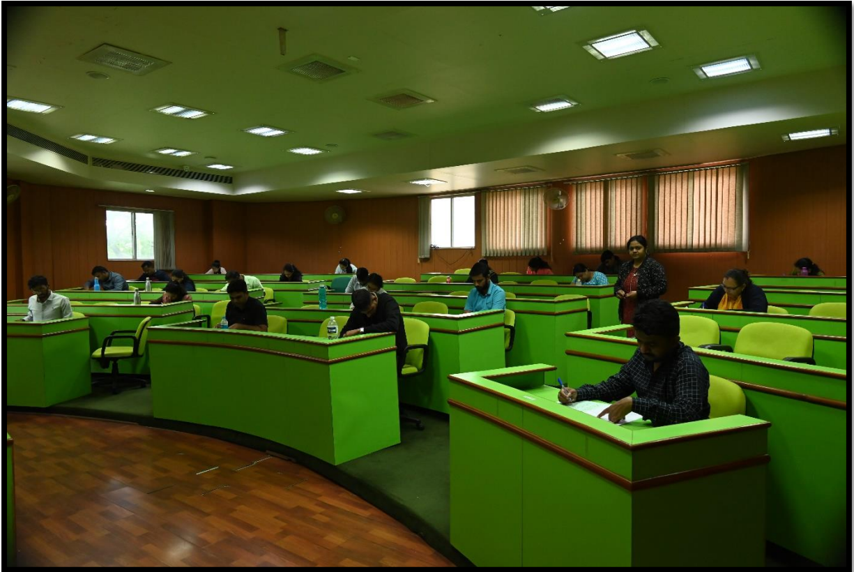
Classroom at Centre for Management Education (CME) Building