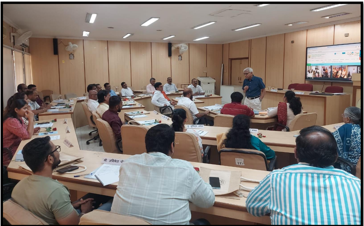
Classroom at VAMNICOM Bhavan